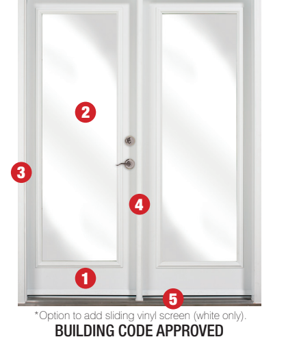
THE MULTIPOINT ASTRAGAL Security, Performance & Hardware all Standard