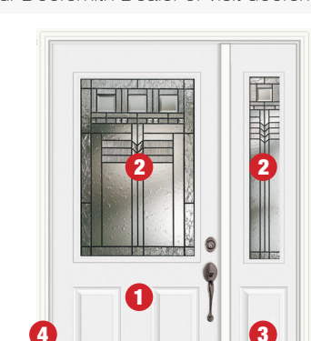
BUILDING CODE APPROVED

BUILDING CODE APPROVED The North American Fenestration Standard (NAFS) has changed the rules for how doors are tested and rated in Canada. When you purchase a Doorsmith system you can rest assured that your entrance has met NAFS performance